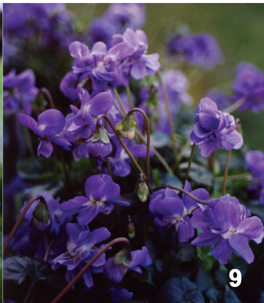
FIGURE 8–9. 8 , Viola 'Marie Louise,' photo by Clive Groves; 9 , Viola 'Parme de Toulouse,' photo by Hélène Vie.