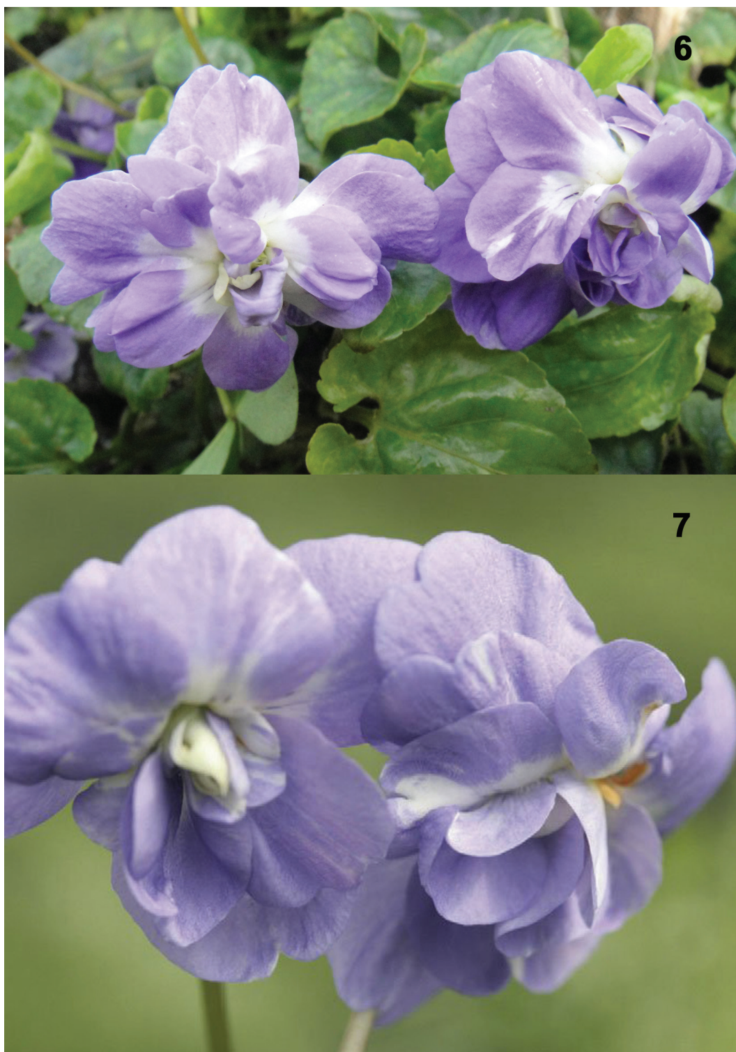
FIGURE 6–7. 6 , Viola ‘Duchesse de Parma,’; 7 , Viola ‘Lady Hume Campbell,’.