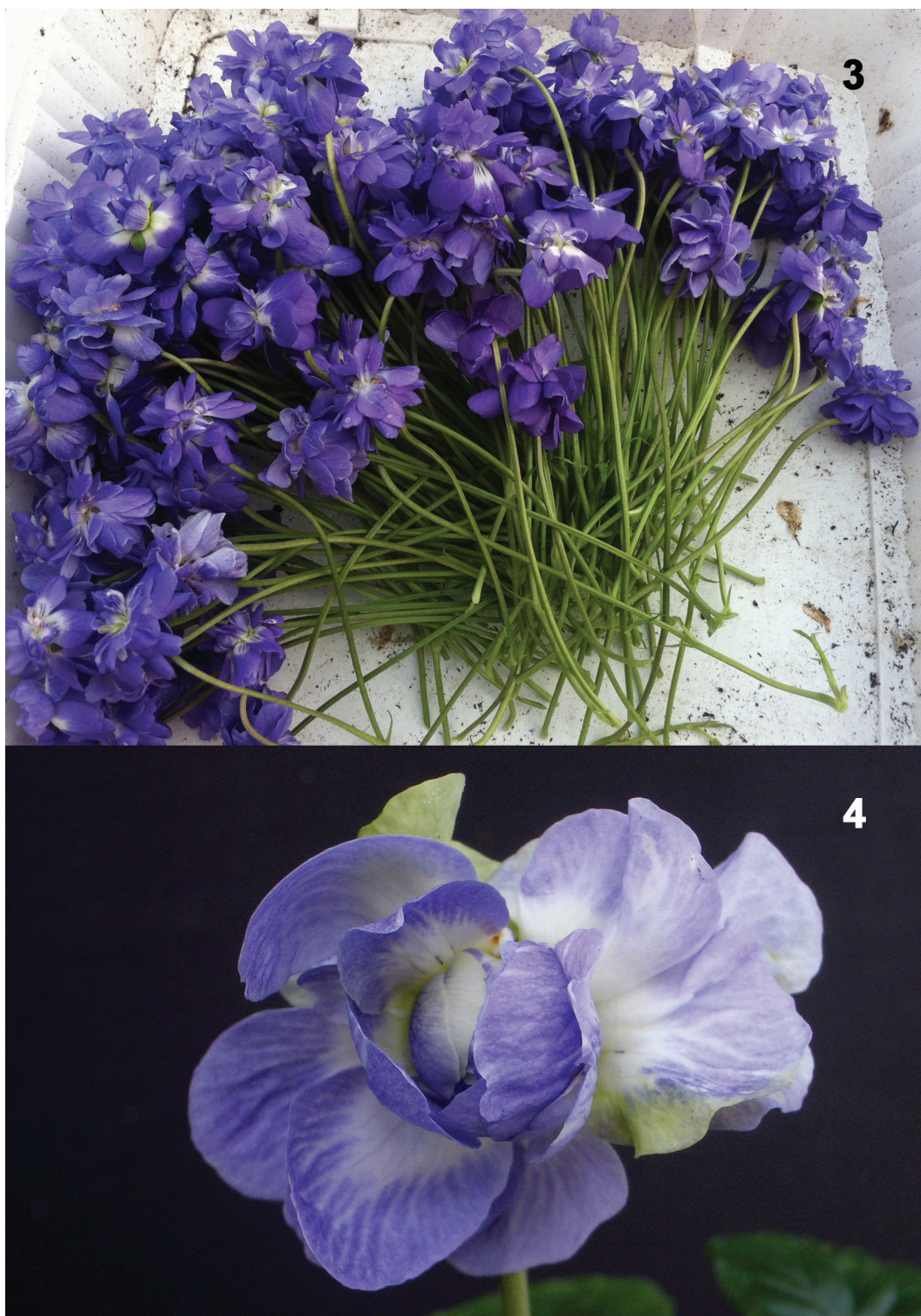
FIGURE 3—4. 3 , Fresh picked flowers of Viola ‘Parme de Toulouse,’ photo by Hélène Vie; 4 , Viola ‘Neapolitan,’ photo by Clive Groves.