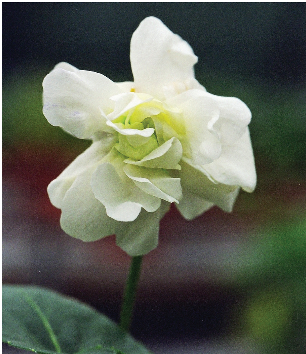
FIGURE 5. Viola 'Conte di Brazza.'

Viola 'Duchesse de Parme' (1870) pale lavender blue flowers; very prolific and probably the easiest to grow (Fig. 6).